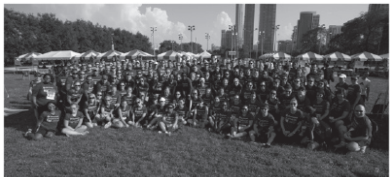
(Bottom) Grant Thornton's team was the largest ever, with over 200 members!

Visit www.CVLS.org/judicata for more pictures!