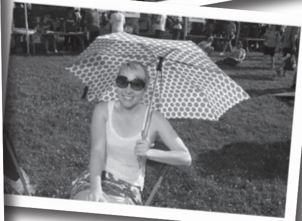
(Top) Drinker Biddle's team enjoying the event