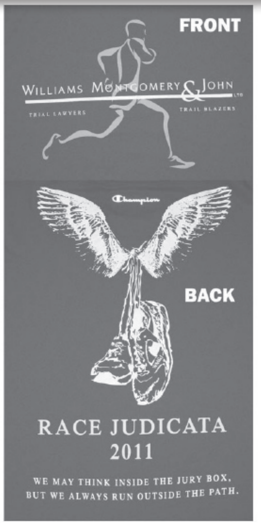
Williams Montgomery & John's winning t-shirt design.